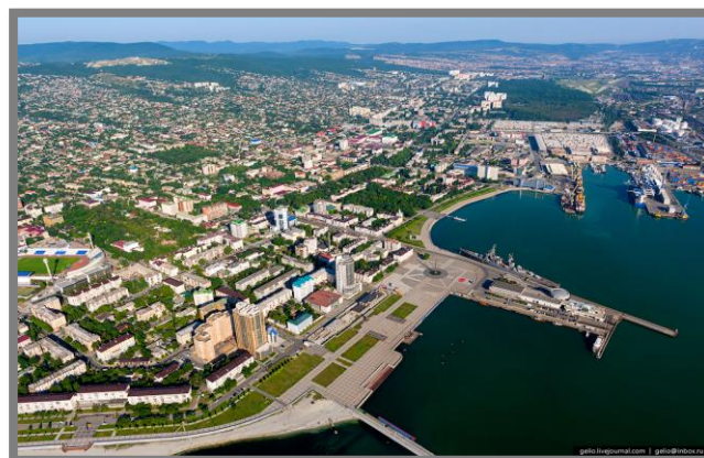
An Aerial View of Novosibirsk