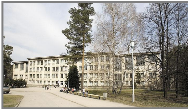
Novosibirsk State University, Novosibirsk, Russian Federation