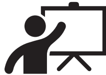
Lecture and Tutorial Workshops